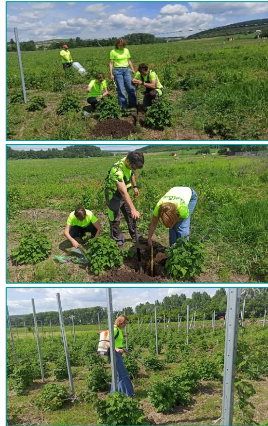
Figure 3. C-SINK BCO 2 pilots

Soil samples are taken periodically throughout the growing season to assess the